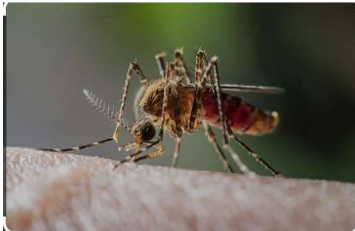
Figure 1 : https://www.istockphoto.com/id/foto-foto/nyamuk-anopheles

In addition, efforts to accelerate the eradication of malaria in the territory of the New Capital are also under way. Malaria eradication is an attempt to reduce the number of people infected with malaria to a very low level or even prevent the spread of the disease. Accelerating the eradication of malaria in the New Capital District is part of the government's efforts to create a healthy and disease-free environment.