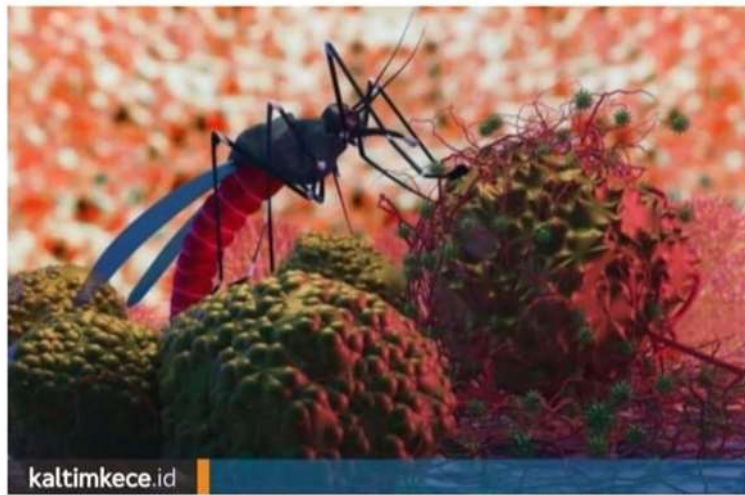
Figure 2 (Nyamuk Anopheles): https://kaltimkece.id/green/health/forests-disappeared-malaria-crazy .

Factors that may cause an increase in the Anopheles mosquito population in Eastern Kalimantan include: The humid land environment is an ideal breeding place for the Anopheles (1). Climate change and extreme weather events can affect the life cycle of the Anopheles Mosquito and increase its population (2). Human activities such as deforestation, planting, and mining can change the environment and create an ideal spreadplace for the anopheles. (3). Lack of public awareness about the dangers of the Anopheles mosquitoes and how to prevent the spread of diseases transmitted by them (4). (5). High population mobility can increase the prevalence of Anopheles mosquitoes and increase the risk of spreading diseases transmitted by these mosquitos. (6).