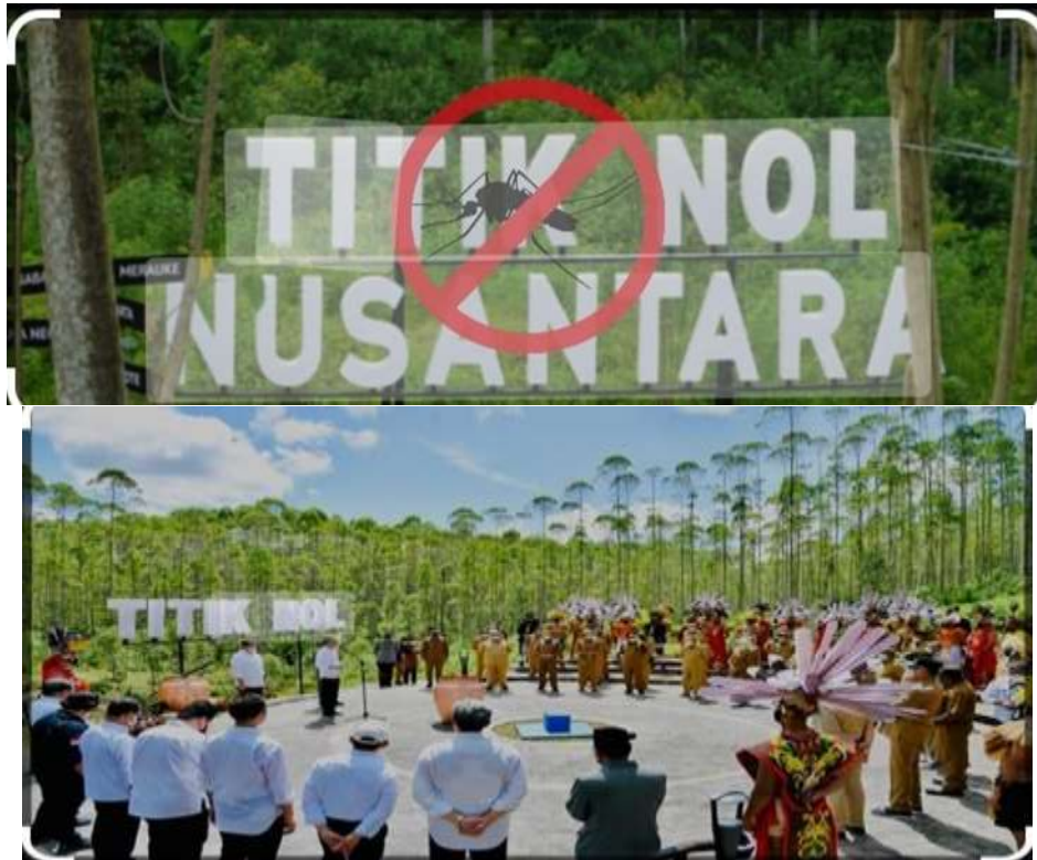
Figure 6 and 7 (President, state staff and local residents treating anopheles mosquitoes in ikn) : https://www.ikn.go.id/autorita-ikn-past-no-there-cases-malaria-di-IKn

Regular monitoring and evaluation of the Anopheles population control programmes that have been implemented to determine whether they are still effective and to improve the programmes if necessary (1). Provide education and education to the public on the dangers of Anopholes mosquitoes and how to prevent the spread of diseases transmitted by them (2). (3). Spray insecticides regularly and sufficiently to control the Anopheles population (4). Optimize collaboration between governments, communities and health agencies in efforts to control the Anopheles mosquito population and prevent the spread of diseases transmitted by them. (5). Conducting more technical research and development. Effective and environmentally friendly to control the Anopheles population (6). Through these measures, the Anopheles mosquito population control program in the new capital is expected to run effectively and the growth of new mosquito populations in the region can be prevented. It can cover various aspects such as: public health programmes, medical research, disease control and development. Here are some points that may be relevant in this context: