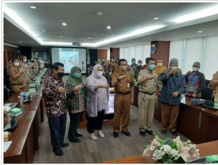
Figure 5 (government and community coordination): https://www.kaltimprov.go.id/news/malaria-elimination-produced-six-deal .

(6). Increased collaboration between the government, the community, and health care facilities is expected to make the population control programme of Anhelophes more effective and reduce the risk of the spread of the diseases contained by such mosquitoes in Eastern Kalimantan.